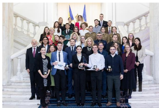
Winning teams of the Nicolae Titulescu Moot Court Competition, December 2023.

The “Humanitarian Law and Refugee Law National Contest- 2023 edition”, the only one of its kind in Romania, was held from 8-10 December with the participation of over 20 students, was organized by the Romanian Red Cross Committee, UNHCR, The Ministry of Justice, the National Defence University “Carol I”, The National Commission for Humanitarian Law, SIMA-Students in Moots Association and the law firm Beatrice Onica-Jarka & Associates. The contest was vibrant with students displaying knowledge and commitment. UNHCR Representative opened the event and handed over the UNHCR award to the Bucharest University winning team for the refugee law section, while the overall contest was won by the “Lucian Blaga” University of Sibiu.