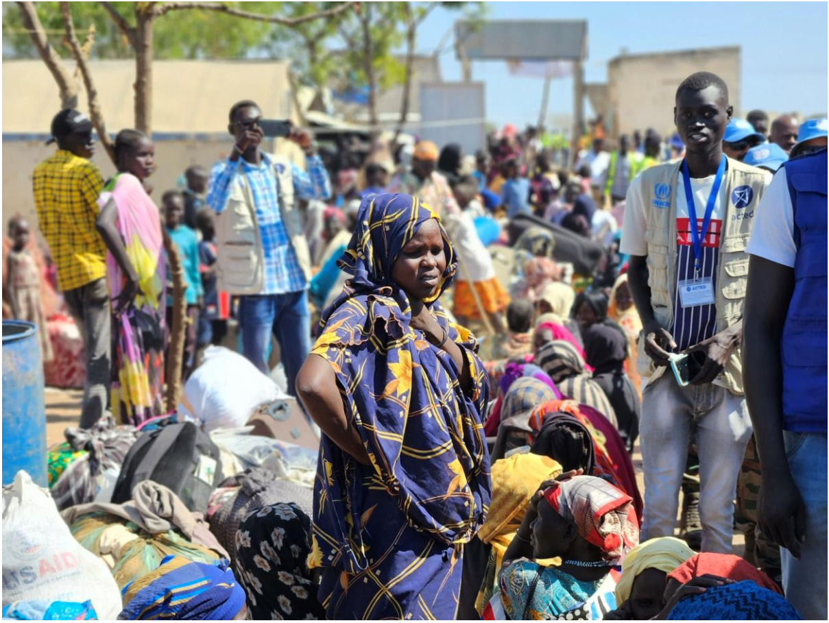
UNHCR and partners at the Renk transit centre earlier this week during a donor mission.