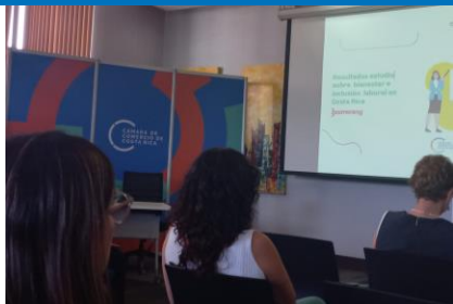
Seminar "What works and what doesn't when designing inclusive organizations?" by our allies Efecto Boomerang and the Costa Rican Chamber of Commerce.