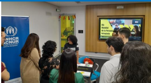
UNHCR and Partner Agencies Fundación Omar Dengo and Fundación Mujer were invited to the internal World Refugee Day celebration at Western Union for awareness talks and entrepreneurship fair