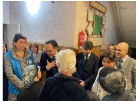
Masis, Ararat province – Delegates from France and UNHCR Representative spoke with refugees in a shelter home about their urgent needs.

On 12 December 2023, UNHCR facilitated a field visit for the French Delegation , which meet with refugees and spoke about their urgent lifesaving needs. The Delegation, including the French Ambassador to Armenia, and a French Parliamentarian, who is also a Member of the Parliamentary Assembly of the Council of Europe, visited a temporary shelter home in Masis town, Ararat region, hosting 67 refugees from Karabakh. Refugees, among them women, children, older people and persons with disabilities were grateful for the French Government's support provided through UNHCR, including the provision of core relief items, that helped them prepare for the winter season.