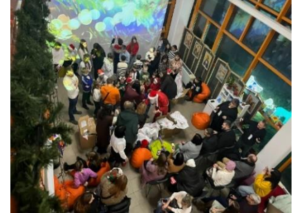
17 December 2023, Gift Bag distribution during a Holiday Party at the Nicolina Centre in Iasi.

UNHCR is grateful to the donors of unearmarked and softly earmarked contributions to the Ukraine situation. UNHCR in Romania is also grateful to donors contributing to its 2023 programmes. For more details: Romania Funding Update - 2023 | Global Focus (unhcr.org)