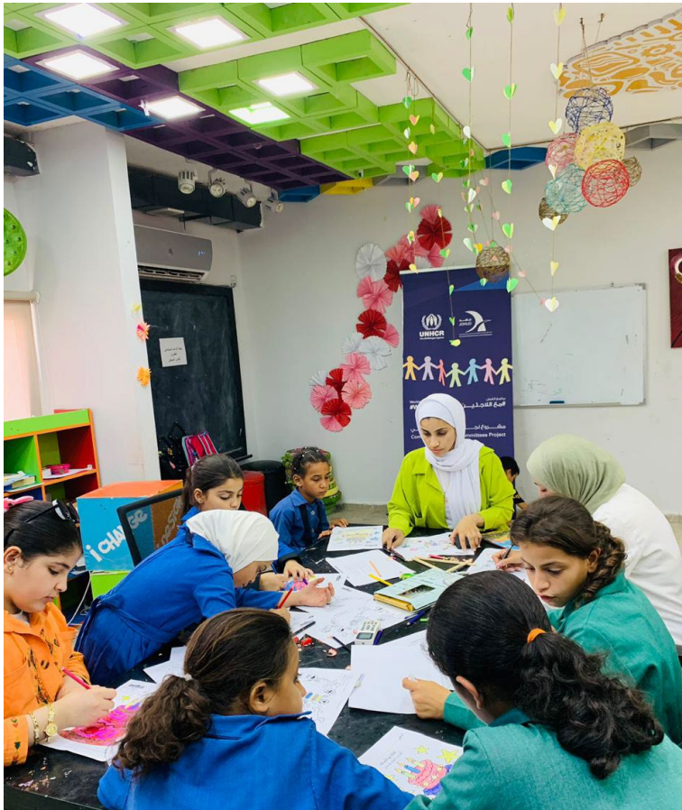
Supported by UNHCR and its partners, community support committees organize a wide range of activities and events for refugees of different ages, countries and backgrounds.

Protection lies at the heart of UNHCR, the UN Refugee Agency. Considering the protracted refugee situation in Jordan, UNHCR has expanded community engagement and supports refugee representation in decision-making and community-led structures. UNHCR also strengthened outreach to refugees who may be outside of its and partners' networks to ensure nobody is left behind. Through these efforts, UNHCR envisions refugees as agents of change and social transformation who bring forward longer-term, sustainable protection solutions.