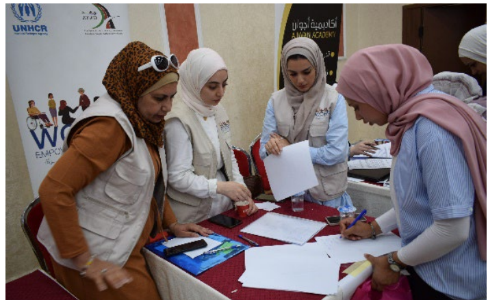
A job fair takes place in Irbid with over 700 participants including refugees