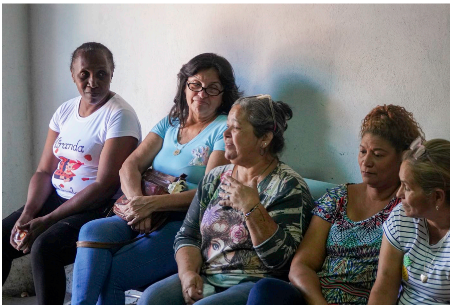
Emotional testimonials from beneficiaries highlight the positive impact of Livelihood workshops funded by CAF's contribution, Petare, Caracas, Venezuela.

Jointly with other UN agencies and partners, UNHCR is implementing area-based spontaneous returnee reintegration pilots in the central state of Miranda, near the capital Caracas, and in the western border state of Tachira, in the city of San Cristobal and the rural municipality of Junín. The pilots aim to support returnees in making their return to Venezuela sustainable through the provision of protection, education, shelter and health services, material and psycho-social support, as well as vocational and livelihoods training, to help them to successfully reintegrate in their communities.