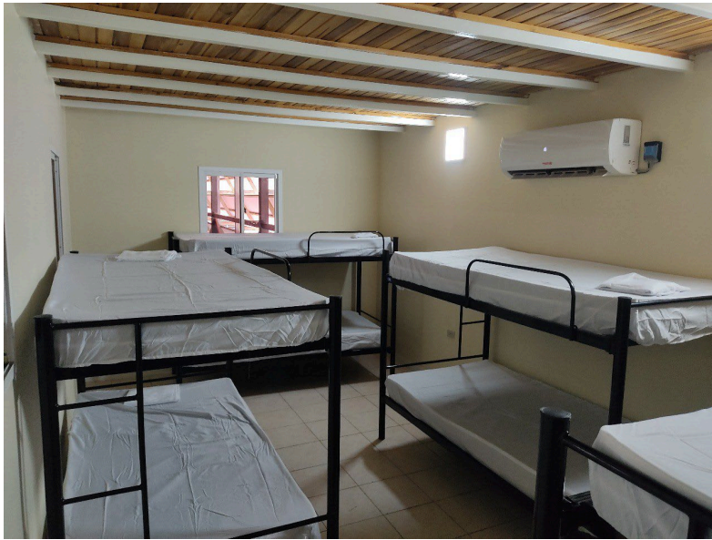
Temporary shelter for people affected by socio-natural disasters, Falcon State, Venezuela.