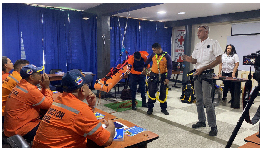
Emergency response workshop for Civil Protection, Zulia State, Venezuela.

The effects of climate change, compounded with poor hydrogeological management, have contributed to making the rainy season in Venezuela a time of natural disasters and emergencies, with increased needs for collective temporary shelters to house and protect the affected population in conditions of dignity and safety, and avoid displacement. Public institutions are often unable to respond effectively to the protection needs of affected populations because of logistical and budgetary limitations. This is where UNHCR steps in to support the provision of core relief items and other supplies needed by affected families and first responders, supporting authorities in dealing with emergencies that strike vulnerable communities impacted by the effects of climate change in Venezuela.