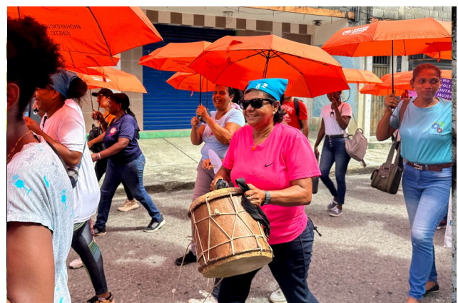
16 days of activism against GBV commemoration in Mamporal