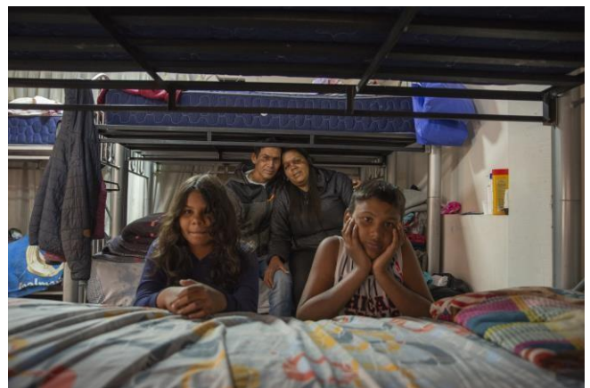
Refugee family in transit in Bolivia hosted in a temporary shelter in La Paz