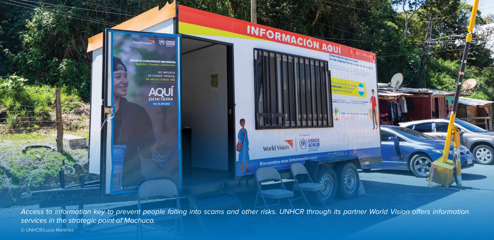
Access to information key to prevent people falling into scams and other risks. UNHCR through its partner World Vision offers information services in the strategic point of Machuca.