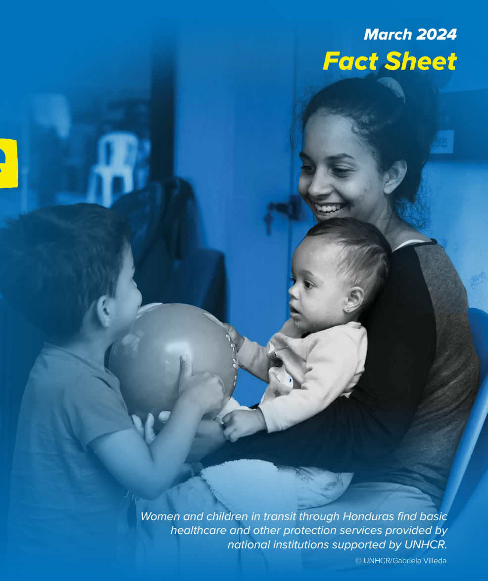
Women and children in transit through Honduras find basic healthcare and other protection services provided by national institutions supported by UNHCR.

The situation at the western border is likely to evolve with continued regional migration shifts. UNHCR will continue to maintain an active field presence and coordination leadership to support people in mixed movements, addressing both immediate needs and longer-term protection challenges.