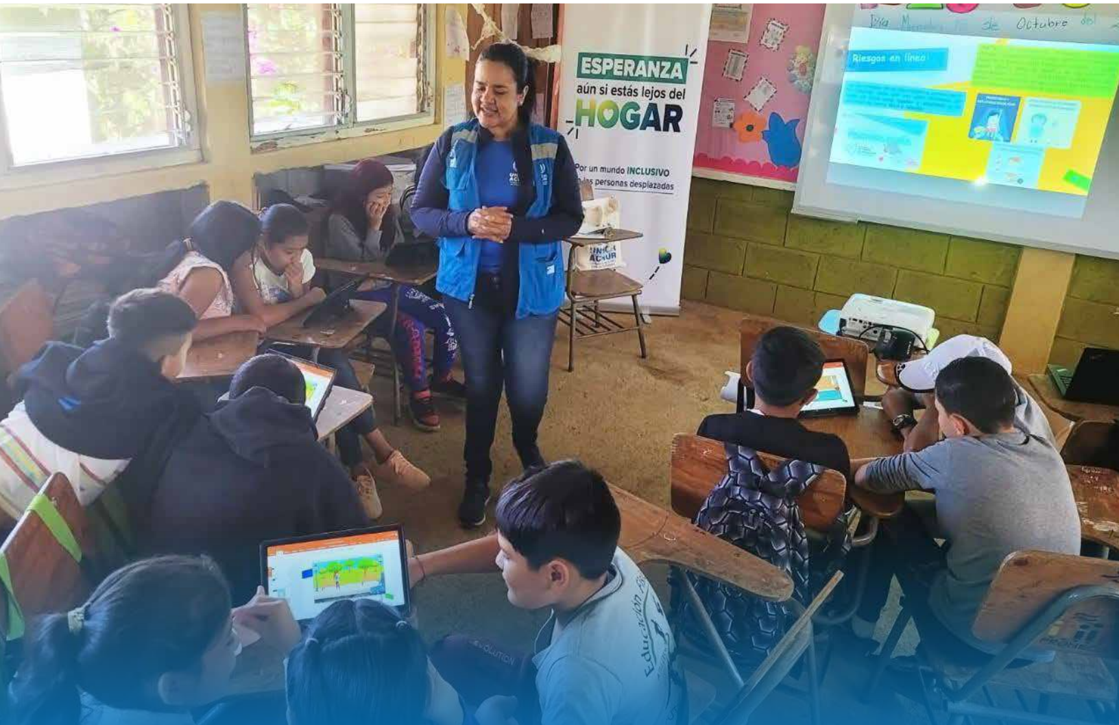
UNHCR promotes “Mobile Library” in schools and community spaces to engage children and youth into digital literacy.

UNHCR has referred cases of people internally displaced or at risk of displacement to livelihood programmes with partners who promote protection through entrepreneurship and job placement internships for youth and with counterparts in vocational training processes.