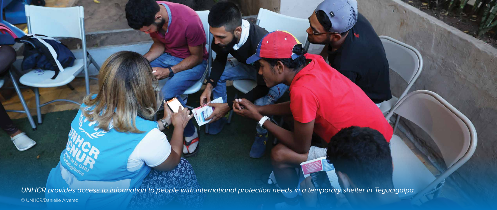
UNHCR provides access to information to people with international protection needs in a temporary shelter in Tegucigalpa.