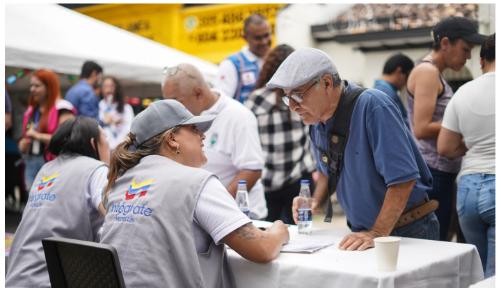
Centro Intégrate supports migrants, refugees, returnees, and host communities in accessing employment, livelihoods, and entrepreneurship. Medellín, Antioquia.