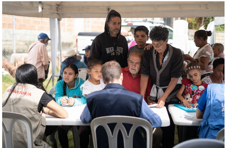
An inter-institutional assistance day so that Venezuelans can access the Temporary Protection Status (TPS), in Bello, Antioquia.