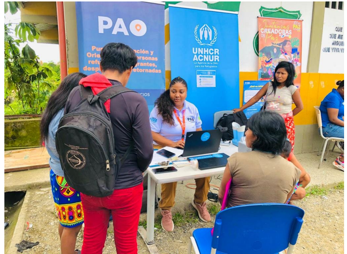
A mobile information and orientation center (PAO) receiving people who require guidance and assistance in Quibdó, Chocó.