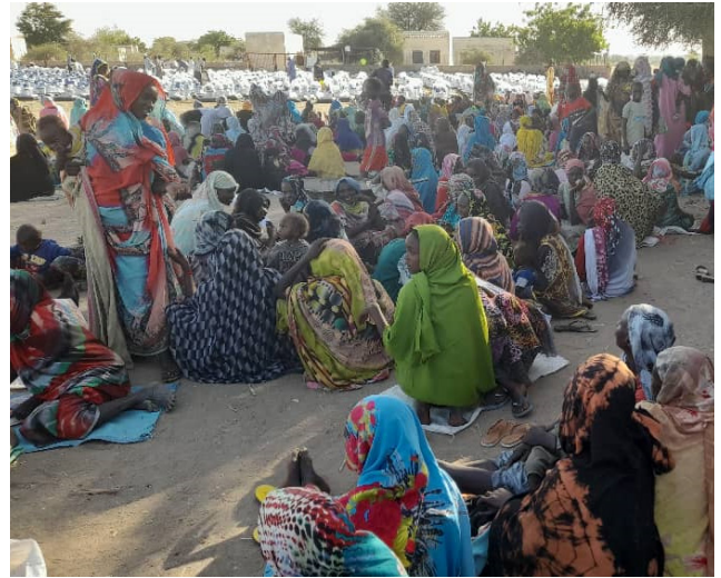
A gathering of displaced families affected by the ongoing conflict in Central Darfur