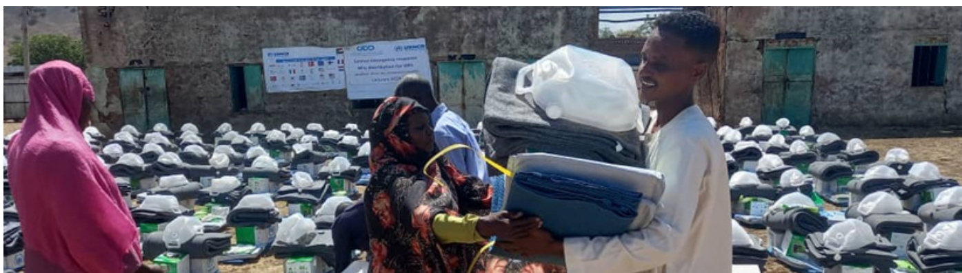
Distribution of core relief items in Sennar State to 720 IDP families displaced due to the conflict