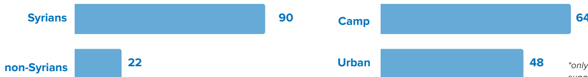
# of Refugees who left Jordan on Complementary Pathways in 2024*

*only number of departures which UNHCR supported or was engaged with