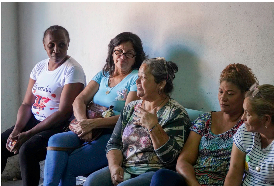
Emotional testimonials from beneficiaries highlight the positive impact of Livelihood workshops funded with CAF's support in Petare, Caracas, Venezuela.

Jointly with other UN agencies and partners, UNHCR is implementing area-based spontaneous returnee reintegration pilots in the central state of Miranda, near the capital Caracas, and in the western border state of Tachira, in the city of San Cristobal and the rural municipality of Junín. The pilots aim to support returnees in making their return to Venezuela sustainable through the provision of protection, education, shelter and health services, material and psycho-social support, as well as vocational and livelihoods training, to help them to successfully reintegrate in their communities.