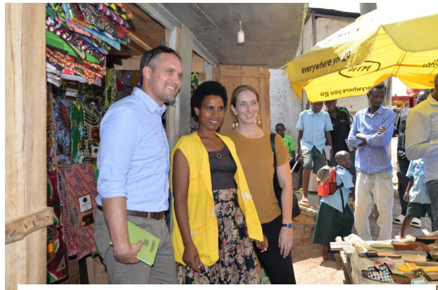
The USA Regional Refugee Coordinator visits the market in Mahama Camp during his visit in February.