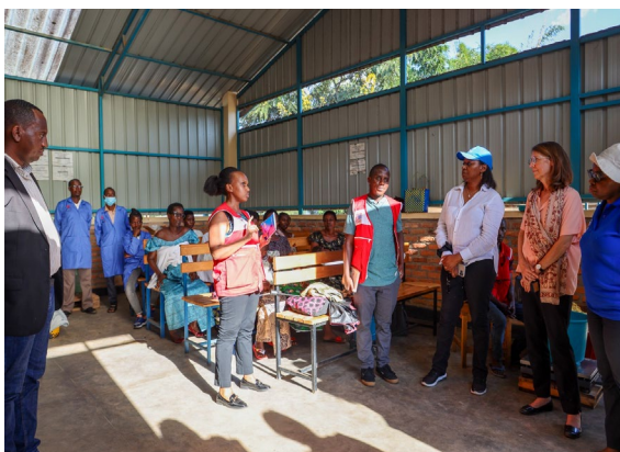
SCI health staff provide a briefing on the nutrition services to refugee mothers and children to German Ambassador and UNHCR Representative during their visit to the Mahama Camp in March.

UNHCR STAFF BASED IN KIREHE SUB-OFFICE COVER THE NEEDS OF REFUGEES IN MAHAMA REFUGEE CAMP