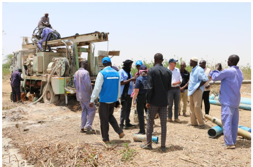
Drilling of a borehole at the new Dougui refugee site