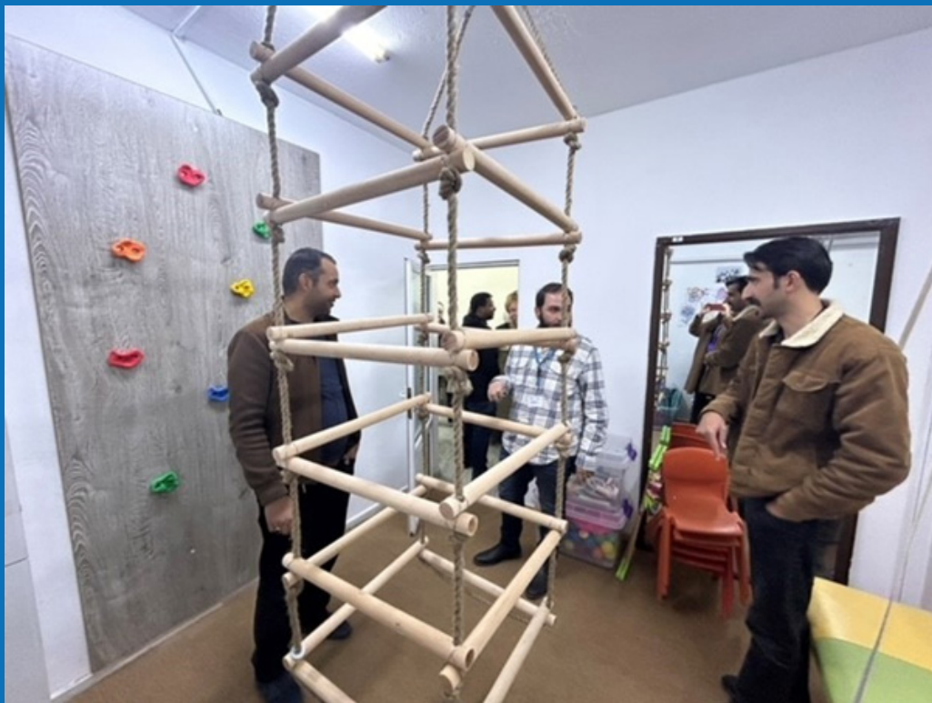
NHF protection center that takes care of women's and children's health