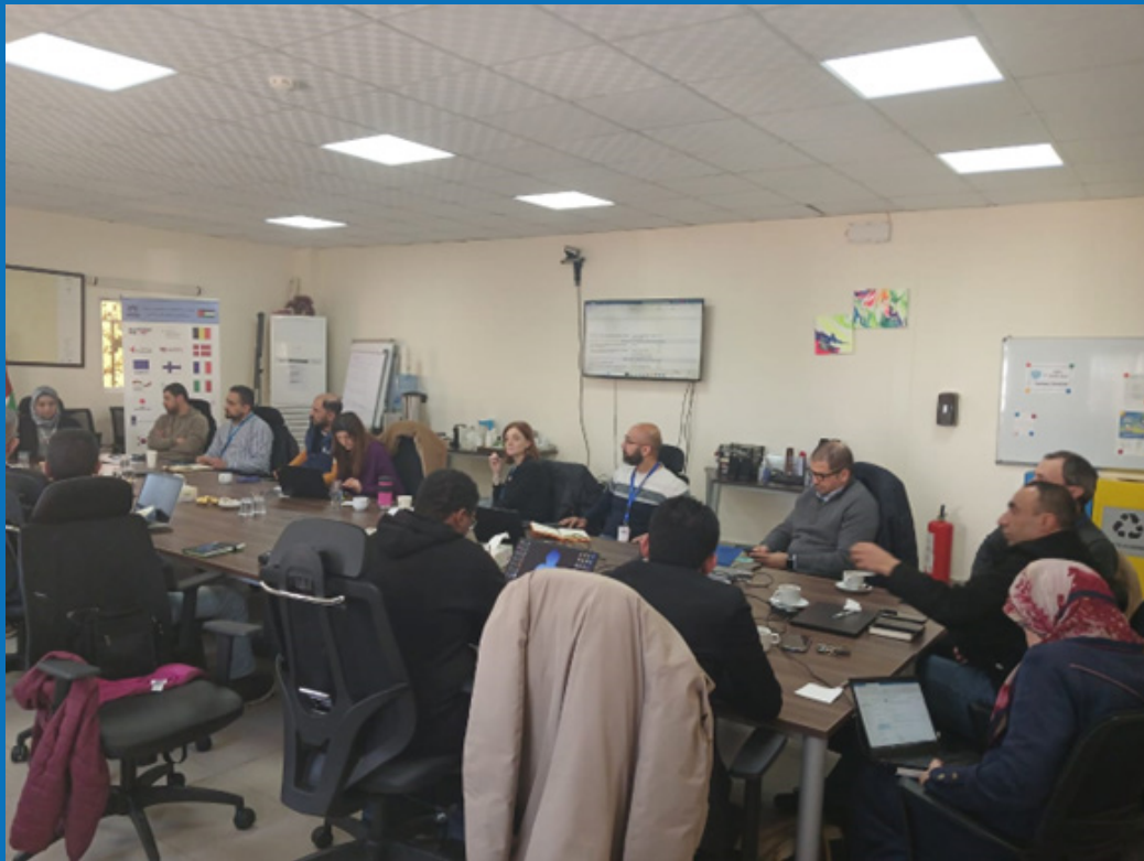
Part of the ISWG Meeting regarding the North Coordination Working Group