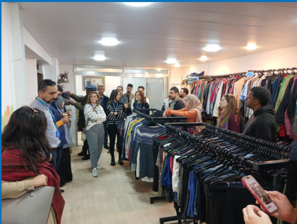
WF Boutique in Irbid City Center for vulnerable populations to shop in dignity