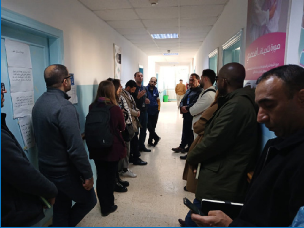
IMC Mental Health Clinic in Alsareeh Governmental Health Center benefiting more than 300 patients/month