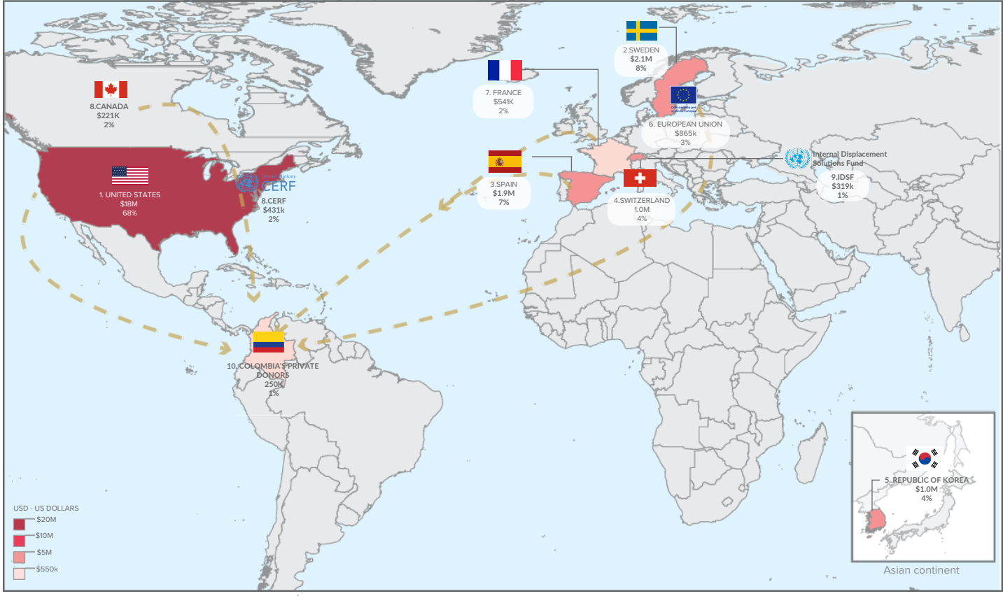
Map 3: TOP 10* UNHCR donors in Colombia (June 30, 2024)

*Note: All amounts are in USD – US dollars