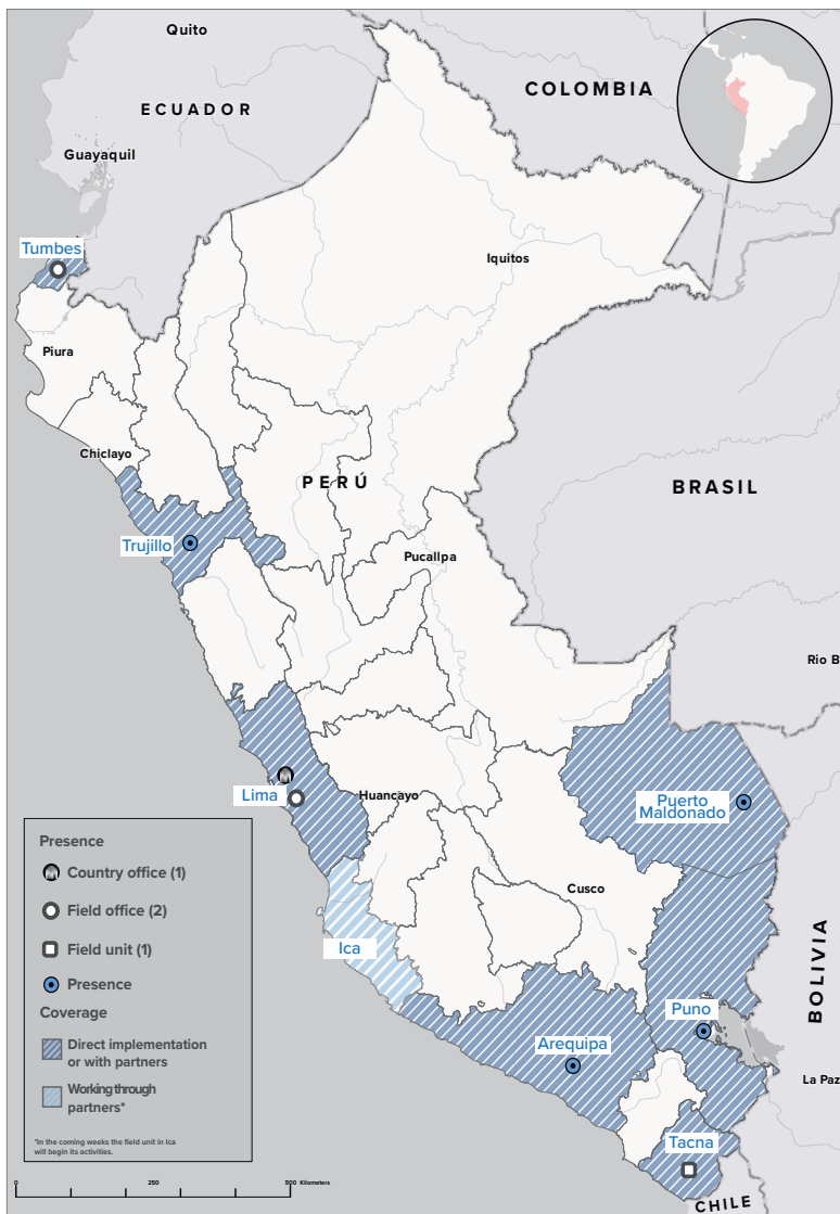
The boundaries and names shown and designations used on this map do not imply official endorsement by the United Nations.

At the 2023 II Global Refugee Forum, Peru pledged to undertake a validation exercise of the asylum backlog to ascertain the accurate number of active cases and expedite the adjudication of claims. Following the removal of duplicate and incomplete files, as well as the cross-check exercise, the CEPR launched the self-validation phase on 1st of May, setting an initial deadline of 15th of July, which was later extended to 1st of October 2024. As of 1 September, 7,407 asylum-seekers had self-validated their claims. Of these, 6,839 confirmed their interest in continuing the process, while 523 withdrew.