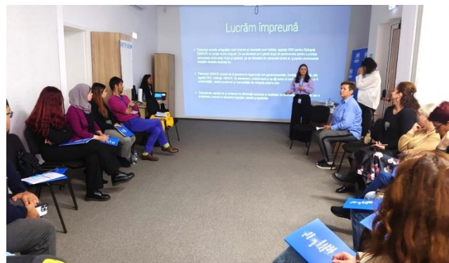
Workshop with participants from DAS, NGOs and RLOs held in Timisoara on 4 October 2024.

On 4 October, UNHCR organized a workshop on the challenges faced by refugees in accessing social services in Timisoara. 13 Representatives from the Directorate for Social Assistance (DAS), NGOs (CNRR, LOGS, Save the Children) and refugee-led organizations (RLO) across the counties of Timis and Arad participated in the workshop. Participants engaged in thematic group work, leading to fruitful discussions on matters such as access to education, employment and social benefits. At the end of the workshop, the representatives of DAS, NGOs, RLO established a network for referrals and information sharing.