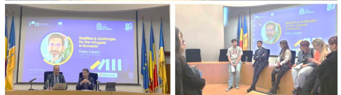
10 October - Workshop at the West University of Timisoara.