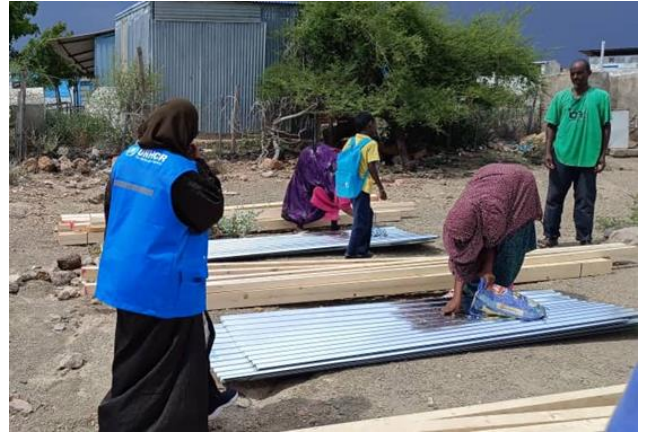
UNHCR provides roofing iron sheets and rafters to 55 refugee families in the refugee village of Ali-Addeh to rebuild their shelters @UNHCR

UNHCR met with the Minister of Social Affairs and Solidarity. On 8 October 2024, UNHCR Representative met with Djibouti's Minister of Social Affairs and Solidarity (MASS) HE Ms. Ouloufa Ismail Abdo. The discussions focused on areas of mutual interests that can facilitate effective integration of refugees and ensure their social protection. In the past, UNHCR and MASS collaborated on several activities including refugee inclusion in national medical insurance scheme, national social registry, refugee profiling and cash assistance for vulnerable urban refugees.