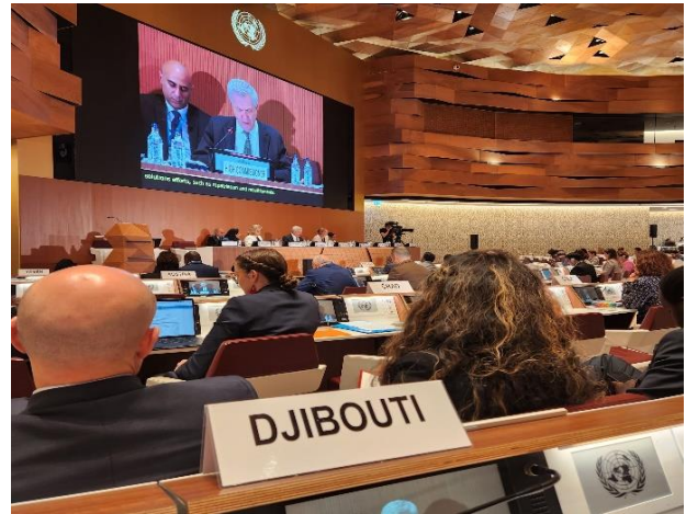
Djibouti attended the 75th session of UNHCR Executive Committee