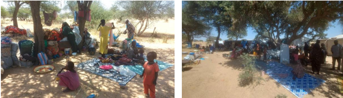
Photos of new arrivals in Koulbus, Chad

Since the beginning of the month, nearly 49,000 people fleeing the violence have crossed the border at the entry points of Birak, Koulbous and Tiné, in Wadi Fira. The vast majority of the new arrivals are women and children. They have found shelter under the trees. Many have survived horrific violence. Among them, 10 injured people were treated by the Koulbous health center. A nursing mother and her four-month-old baby died at the center from their injuries.