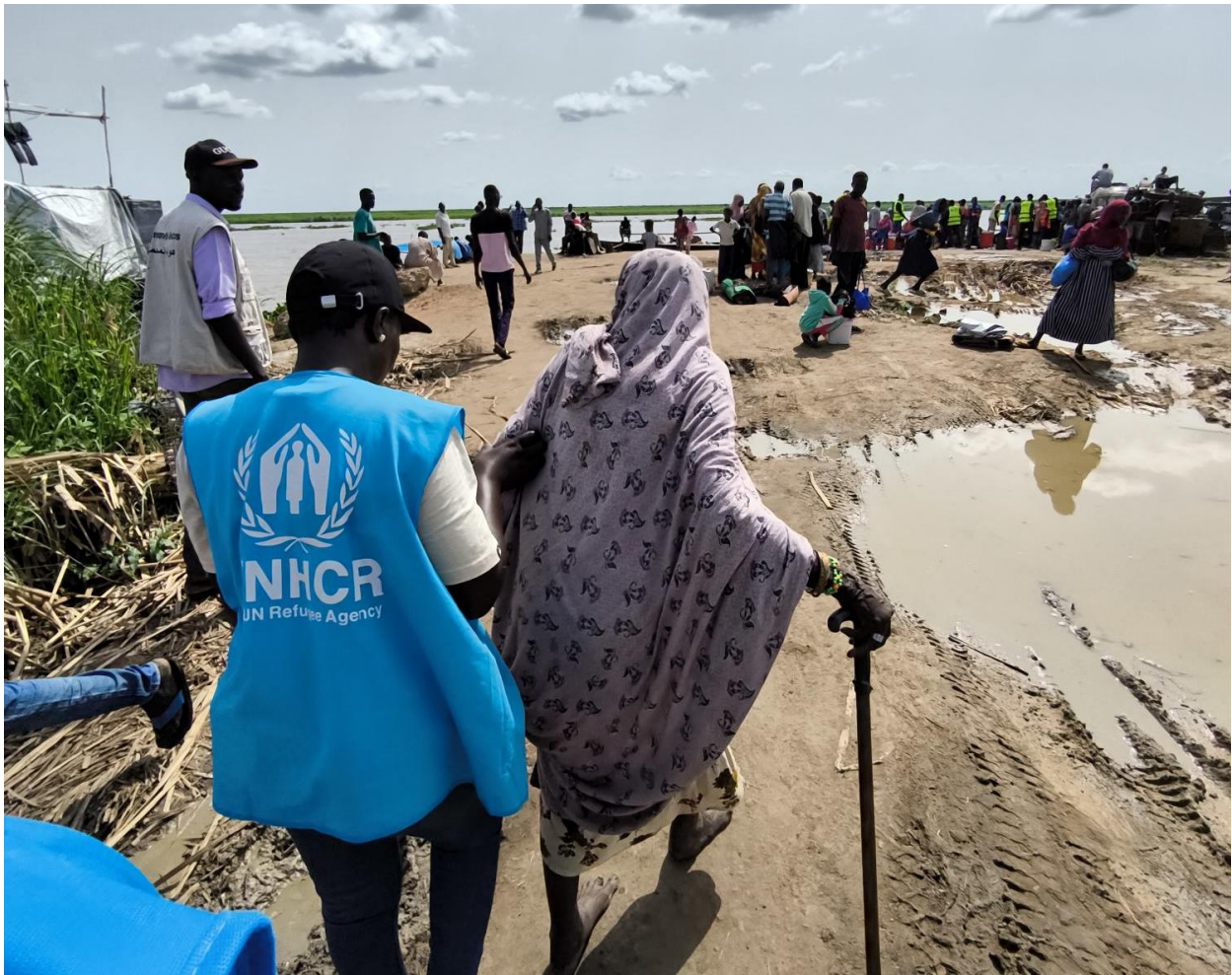
Support to older persons during relocation of Nubian Refugees