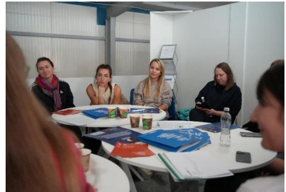
Private sector partners interacting with refugees from Ukraine at RomExpo, Bucharest – 22 October 2024

On 22 and 23 October, UNHCR together with partners hosted the visit of a large private sector delegation led by Adyen , which is a major UNHCR donor. During the two days 14 managers from Adyen, Adidas, Spotify, Sphera and Wolt got acquainted with UNHCR's Romania operation around the topic of pre-during-post emergency. They visited RomExpo, UNHCR's service hub for refugees where they interacted with refugees from Ukraine around thematic groups, accompanied by partners such as World Vision, Jobs4Ukraine, Sensiblu, Romanian National Council for Refugees (CNRR) and Estuar Foundation. The delegation witnessed the strength and resilience of refugee women in Bucharest that benefit from the refugee-led organization Malva and learned about UNHCR's protection programmes for the most vulnerable refugees, including through Terre des Hommes.