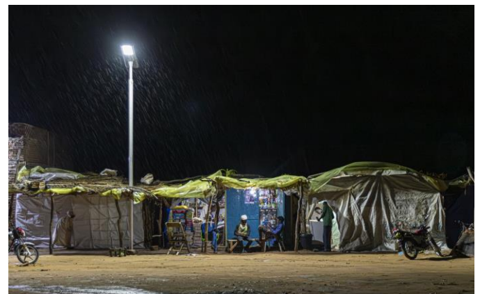
UNHCR installs solar streetlights to provide protection for refugees at night and to enhance livelihood activities in Zabout