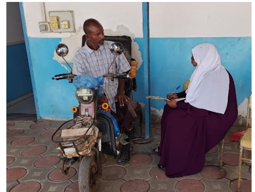
Enrolment of refugees living with disability into the national system

The Djibouti Government launched the enrolment of refugees living with disability into the national system. On 10 November 2024, the Djibouti government through its National Agency for people living with Disability (ANPH) started the enrolment of refugees living with disability into the national system. The exercise started in Djibouti city and will continue in all three refugee villages, UNHCR is playing a supervisory role in the exercise and is ensuring that refugees are informed about this exercise to ensure the collection of accurate quality data. At the end the enrolment exercise, all registered refugees will be granted with the Mobility Inclusion Card that will grant them equal access to special treatment, and ease access to services and economic opportunities anywhere in Djibouti.