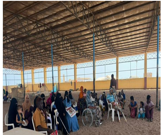
Refugee living with disability were registered in Markazi village.

The Djibouti Government continued the enrolment into the national system of refugees living with disability. During the reporting period, the Djibouti government through the National Agency for people living with Disability (ANPH) continued the enrolment into the national system of refugees living with disability residing in refugee villages. About 49 refugees living with disability have been registered in Djibouti city and Markazi settlements only, the exercise is still ongoing to cover all three refugee settlements. The types of disabilities recorded so far are mental, hearing impairments, physical and visual. The vulnerability codes were automatically inserted into the UNHCR database (PROGRES) for everyone registered by the ANPH.