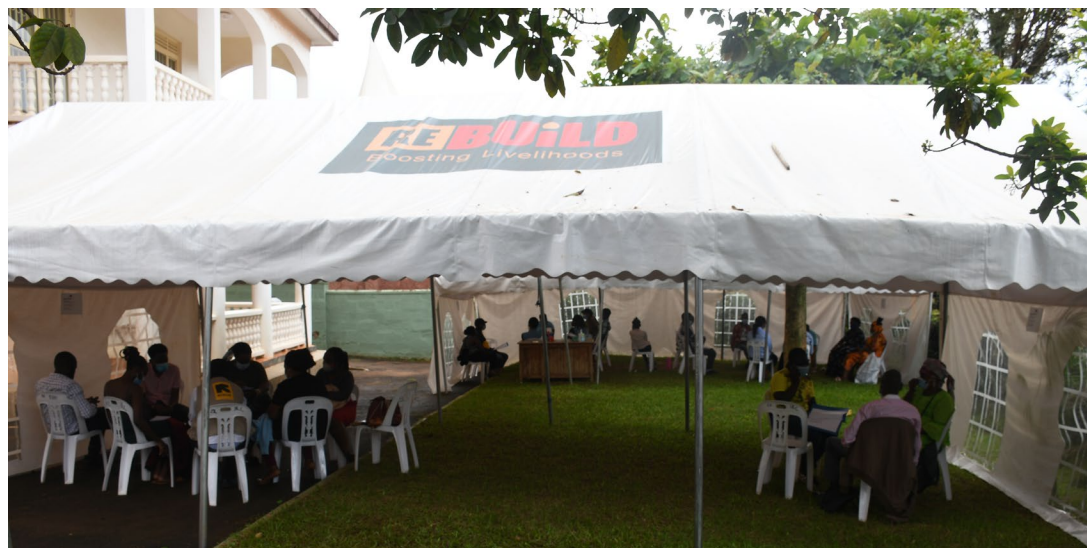
Figure 3.1. Mentorship groups participate in their first meetings at the Livelihoods Resource Center during piloting

that their needs are often larger than those of mentees (e.g. larger families) even if their businesses are doing slightly better. After discussing the reasons for the disparities, mentors often suggested that they should get at least half of what their mentees are receiving.