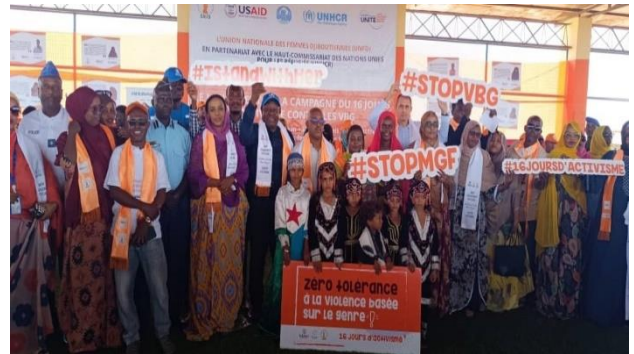
UNHCR and partners launched 16 Days of Activism against GBV

UNHCR and partners launched the campaign against gender-based violence. On 25 November, UNHCR, in partnership with the National Union of Djiboutian Women (UNFD), launched the "UNiTE against gender-based violence" campaign, which will run for 16 days from 25 November to 10 December. The campaign was launched in the refugee village of Markazi in the presence of government representatives, local authorities, UN agencies, refugees and other humanitarian partners. All partners agreed on the need for active cooperation to promote women's empowerment and strengthen local initiatives. UNHCR awarded certificates to refugee committees that support the fight against sexual and gender-based violence, in recognition of their commitment and active role in transforming their communities.