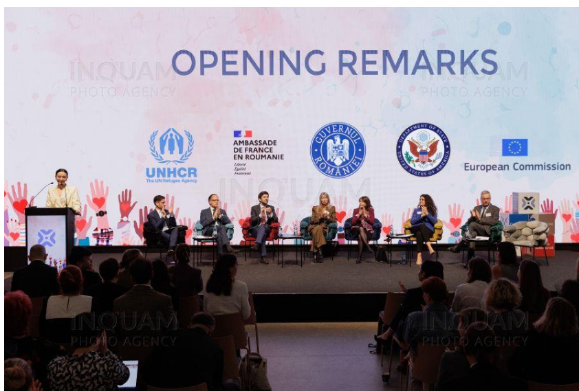
Speakers at the Inter-Agency Donor Meetup Event which took place at the Nord Events Centre by Globalworth on 18 October.

On 18 October 2024, the Inter-Agency Coordination Unit held a Donor Meetup Event in Bucharest in support of RRP partners in their work with the Romanian host communities that welcome refugees, and with refugees from Ukraine. The event took place under the auspices of the Chancellery of the Prime Minister and was co-hosted by UNHCR, the Embassy of France, the Embassy of the United States of America, and the European Commission Representation in Romania. Over 120 participants from the government, embassies, international organisations, the private sector, and civil society attended the event. Following remarks made by Romanian authorities, Ambassadors, and the UNHCR Representative, there followed a networking session in a marketplace format where 29 RRP partners had the opportunity to exchange their programming priorities for host communities and refugees with embassies and the private sector.