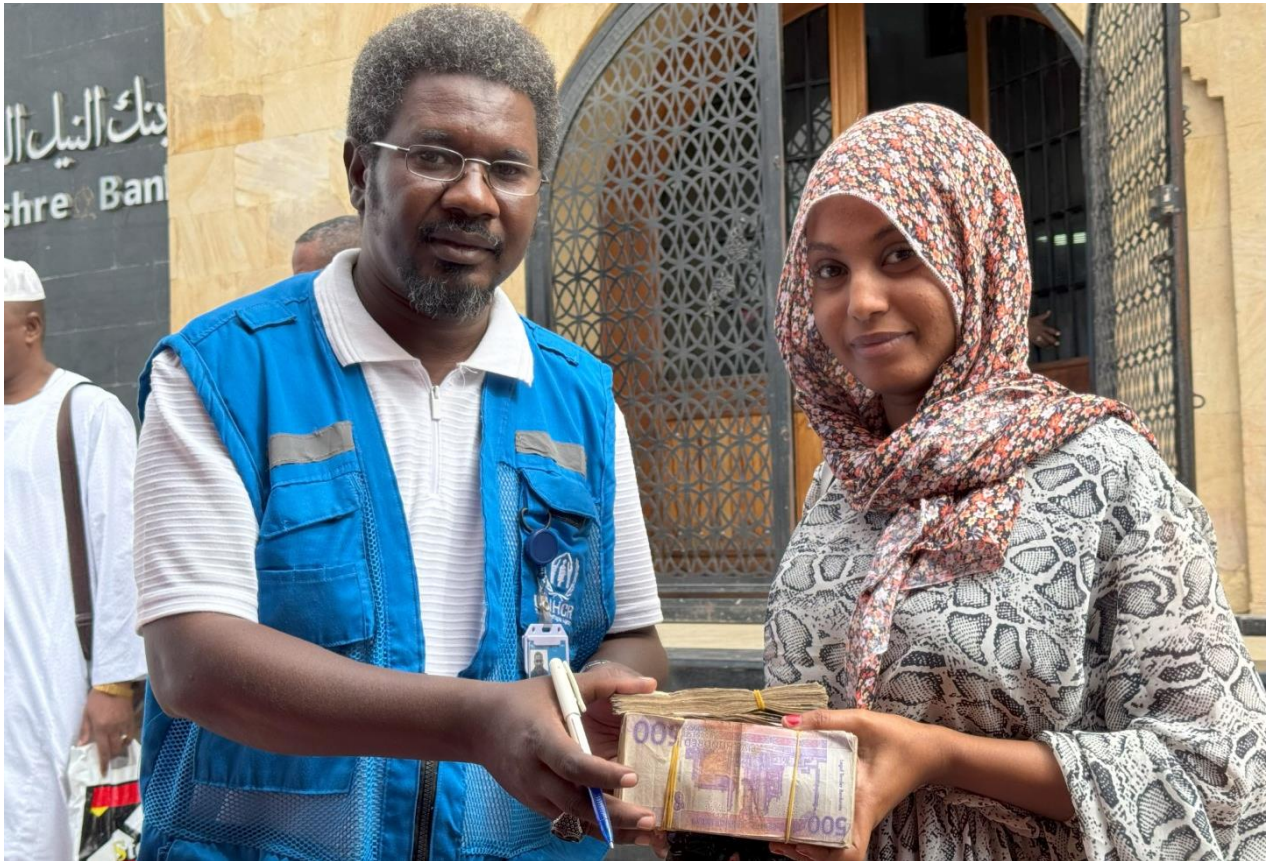
A refugee university student in Port Sudan receives cash assistance to support her education.