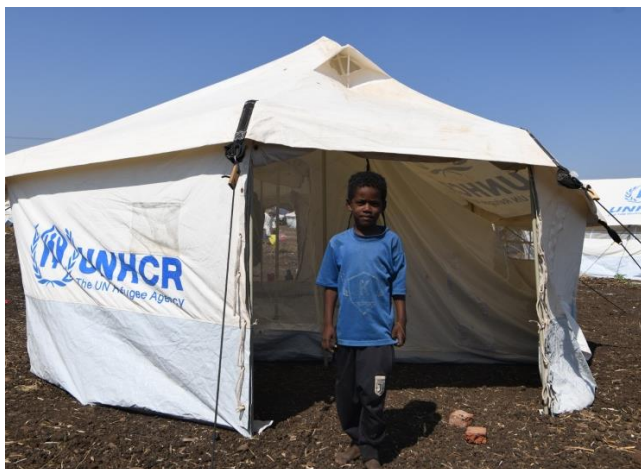
A young boy stands in front of his family's tent in Gedaref State after fleeing recent violence in Al Jazirah.