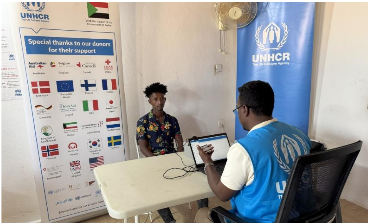
Registration of Ethiopian refugees at Um Rakuba Camp, Gedaref State.