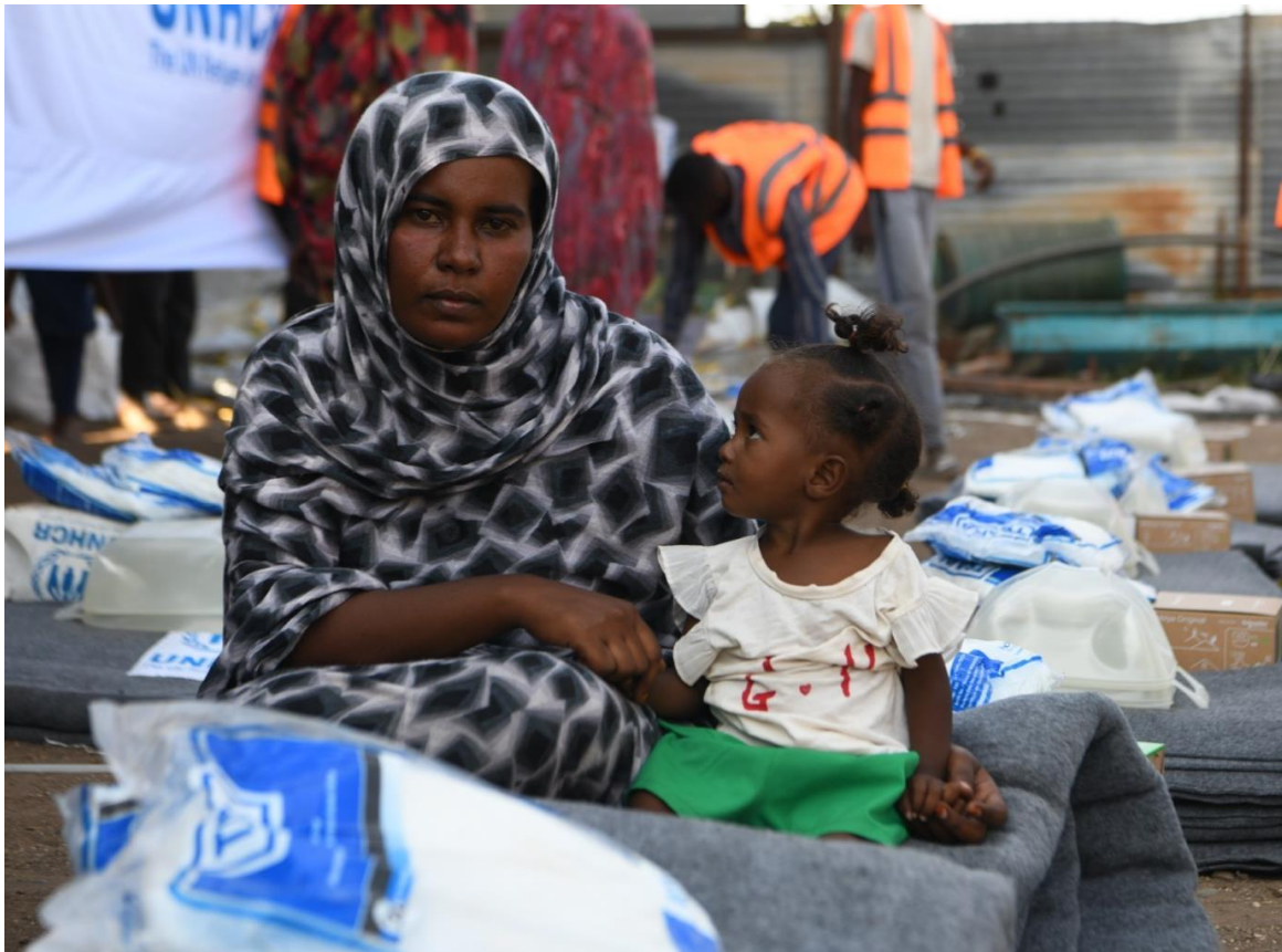
Over 250 displaced Sudanese families in Al Rabwa displacement site in Gedaref town, Gedaref State, received essential relief items provided by UNHCR.