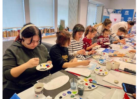
Ukrainian children taking part in art therapy activities in Galați, Romania.

On 10 January, UNHCR Romania launched the 2025 Grant Agreement Call for Expression of Interest: Creating new opportunities for partnerships with refugee-led organisations and community-based organizations . The purpose of the programme is to strengthen community engagement efforts by supporting and empowering grass roots organizations involved in advocacy, protection, and assistance services at the community level in Romania. The organizations will actively contribute to the implementation of the 2024- 2026 UNHCR Multi-Year Strategy for the protection and inclusion of refugees in Romania. In 2024, the Grant Agreement programme supported eight organizations activating in six locations across the country (Bucharest, Sibiu, Mediaş, Arad, Suceava and Galați). Throughout the year, around 2,500 women, children, teenagers and elderly have benefitted of various services and activities.