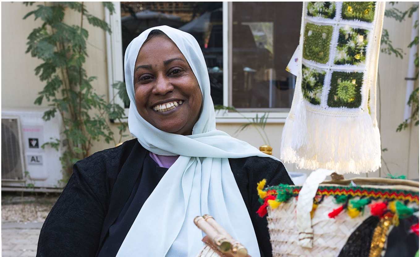
A Sudanese refugee showcases her handcrafted products at a livelihoods fair hosted by UNHCR in Cairo on 19 December 2024.

In the second half of December 2024, UNHCR supported Sudanese refugees in showcasing and selling their products at various livelihoods events. From 12 to 21 December, UNHCR participated in the "TURATHNA Exhibition for Handicrafts and Heritage" in Cairo, which featured items created by 21 refugees and asylum-seekers. These were presented in collaboration with three local social enterprises—Yadawee, Threads of Hope, and Samar Hakeem—operating under the MADE51 initiative. On 19 December, UNHCR and its partners organized a refugee celebration event in Cairo to promote social cohesion. The event showcased the exceptional talents and creativity of refugees through music, art, and craftsmanship, along with displays of handmade goods and other products. These initiatives highlighted the resilience of refugees and their valuable contributions to the community.