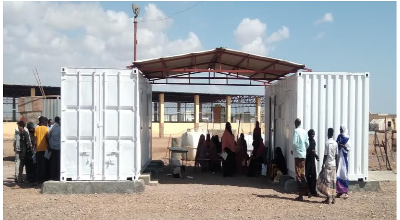
UNHCR has completed the rehabilitation of the Markazi health center @UNHCR

The Solidarity Caravan arrived in Ali-Addeh. On 16 January, the Solidarity Caravan led by the Minister of Social Affairs and Solidarity arrived in the village of Ali-Addeh, located in the Ali-Sabieh region, home to 24,769 refugees and asylum