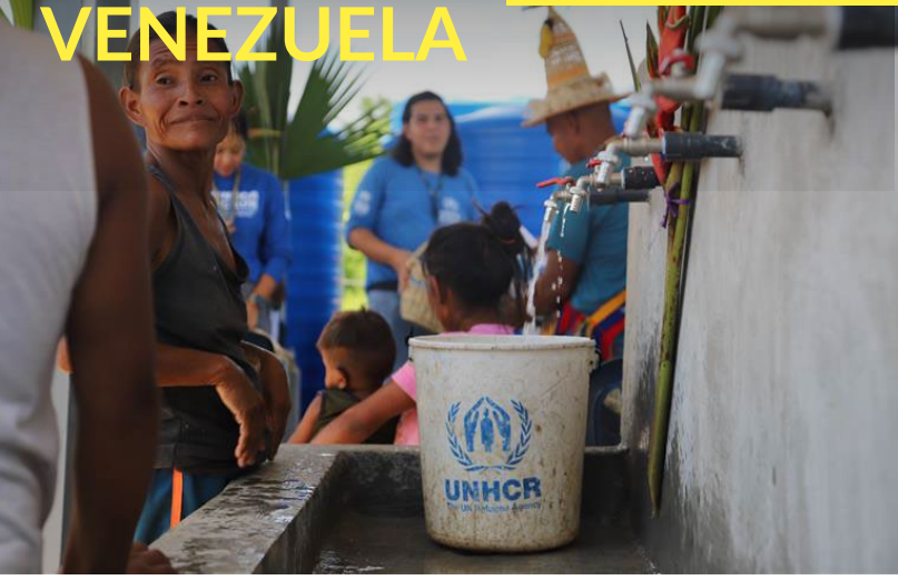
Rainwater storage system for Yukpa indigenous families, Sierra de Perijá, Zulia state.

As Venezuela continues to be mired in a political and constitutional crisis following the 10 January presidential inauguration, UNHCR looks back at what was achieved during 2024. Last year was characterized by restrictions to humanitarian access, extreme political polarization and a violent aftermath to the 28 July presidential elections that led to the emergence of new community protection needs, new protection profiles and a renewed operational focus on tackling the cycle of displacement affecting the country, and the región as a whole. The Operation spearheaded community resilience and returnee reintegration initiatives with implementing partners, other UN agencies, local authorities and private sector allies, providing support to vulnerable Venezuelans determined to remain in the country and sustainable options for those who return to Venezuela. Despite the difficulties, return population movements identified by UNHCR showed a moderate increase compared to 2023, registering a 4/6 returns/exits ratio, providing further stimulus and encouragement to UNHCR's efforts to tackle the social, economic and environmental drivers of displacement in Venezuela.