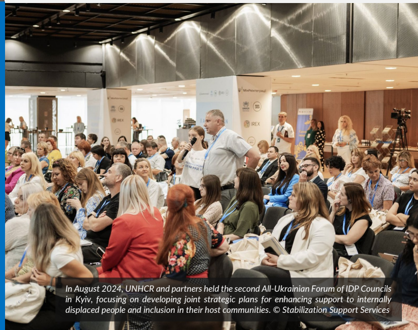
In August 2024, UNHCR and partners held the second All-Ukrainian Forum of IDP Councils in Kyiv, focusing on developing joint strategic plans for enhancing support to internally displaced people and inclusion in their host communities.

UNHCR and its local NGO partners, notably Stabilization Support Services (SSS), have been actively engaged in the development of Cabinet of Ministers Resolution #812 on IDP Councils. Before Russia’s full-scale invasion, the Councils existed primarily in Donetsk and Luhansk oblasts. These consultative bodies, composed of local authorities, IDPs and civil society representatives, exist at oblast and local levels to serve as a link between IDP communities and the local authorities to facilitate IDPs active participation in public decision-making. They are tasked with developing recommendations to ensure that IDPs are included in local policies and programmes supporting durable solutions, particularly on housing and livelihood opportunities. The Resolution received strong support from the former Ministry of Reintegration of the Temporarily Occupied Territories. So far, UNHCR and its NGO partners, most notably Stabilization Support Services (SSS), have supported the establishment of and provided capacity development to over 100 IDP Councils. Read more about their work here .