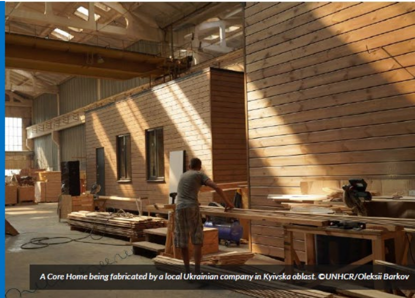
A Core Home being fabricated by a local Ukrainian company in Kyvska oblast.

LOCAL PROCUREMENT: Local suppliers are vital to the work of UNHCR in Ukraine, allowing for timely and cost-efficient supply of assistance and the material delivered by UNHCR in its response, while boosting local economy and businesses negatively impacted by the war. One such example is the supply of Core Homes (prefabricated houses) to war-affected communities across Ukraine. The company producing the Core Homes is a family-run business that was established in 2016 and specializes in manufacturing modern, energy-efficient, and durable modular houses. In 2023, in cooperation with UNHCR, the company installed 100 Core Homes in Kyvska and Chernihivska oblasts on land plots where the house was fully destroyed, allowing families to return to their own land. The programme continued in 2024, where 150 core homes were delivered in central, eastern and southern Ukraine. A further 150 units will be delivered in 2025.