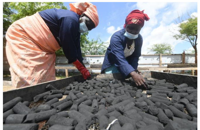
Eco-friendly briquettes (cooking charcoal) provide safe and better alternative for cooking, hence protecting environment