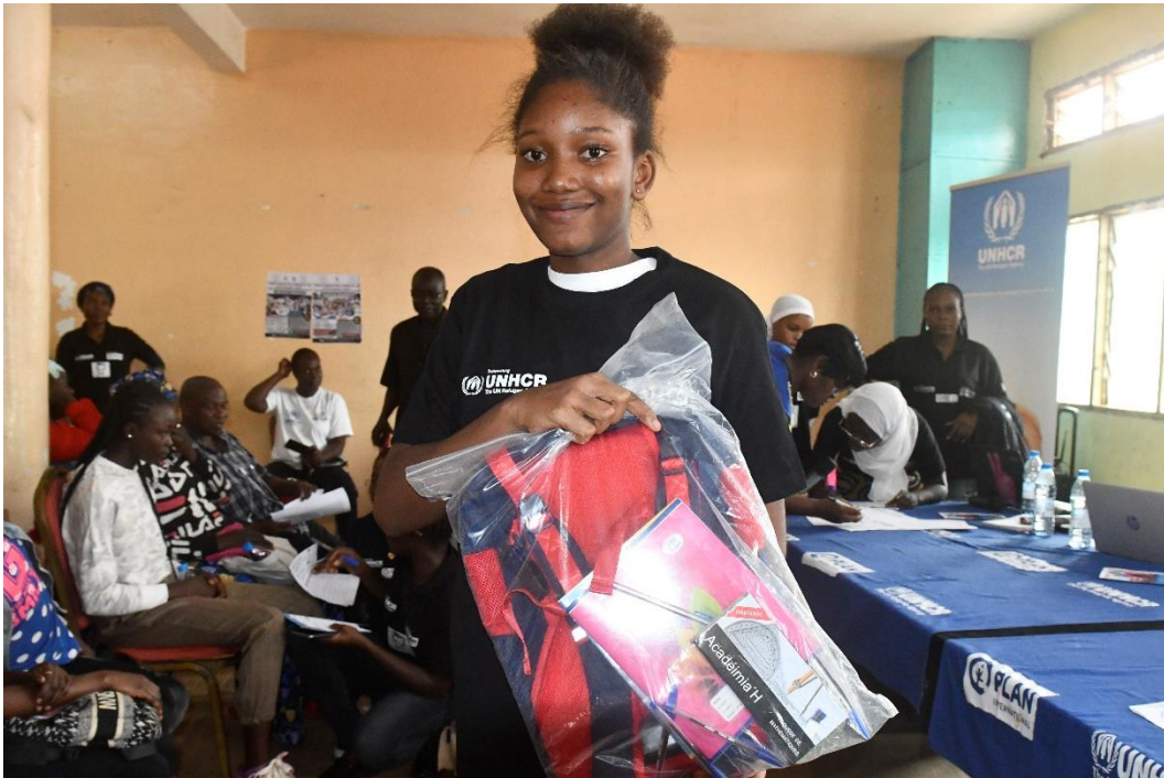
Refugee girl in Yaounde receives didactic materials to ease preparations for back-to-school.