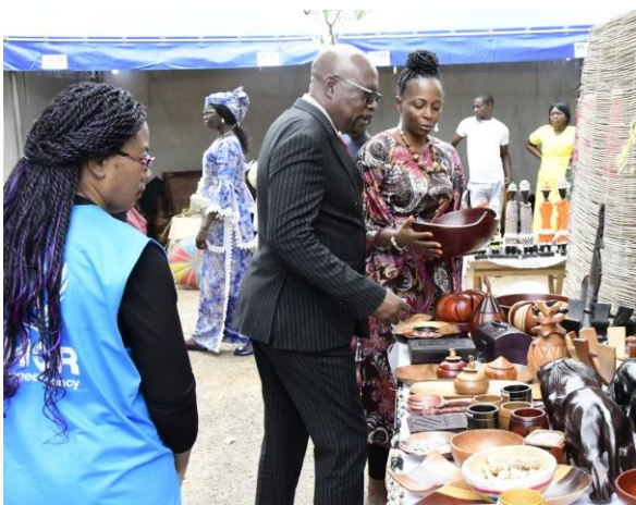
Refugees displaying hand crafted made artifacts at 8th International Crafts Fair of Cameroon (SIARC)