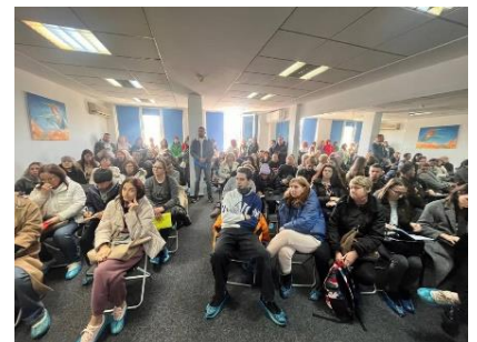
Information session on documentation, Constanta, April 2025.

On 11 April, UNHCR took part in an information session on documentation for refugees from Ukraine, organised by the Civic Resource Centre facilitated by the Constanța General Inspectorate for Immigration Service with support of UNHCR's partner the Romanian National Council for Refugees (CNRR). With around 140 participants, the session was held in two parts to ensure everyone received clear, accessible guidance on applying for long-term residence permits. For refugees facing uncertainty, this timely support provided critical information that helps them take concrete