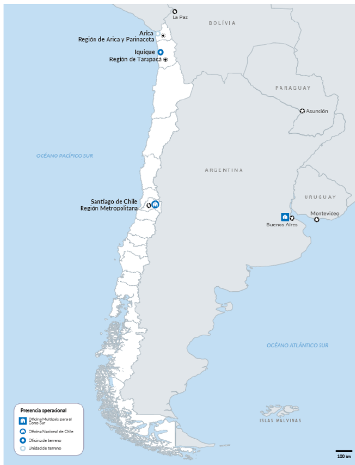
La Oficina Regional de ACIUR para el Sur de América Latina cubre las operaciones en Argentina, Bolivia, Chile, Paraguay y Uruguay. Tiene su sede en Buenos Aires, Argentina.

UNHCR continues to strengthen strategic partnerships with the public and private sectors to provide assistance, protection , and solutions, as well as to develop tools that empower people in need of international protection on their path to real and effective socio-economic integration .