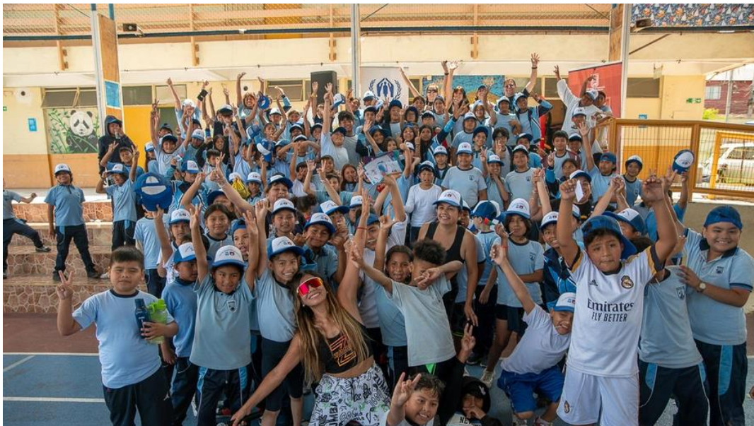
The end-of-school-year activity at Centenario School in Iquique aimed to strengthen the appreciation of diversity, promote multiculturalism, and foster closer ties among members of the school community, which has a high percentage of foreign students.