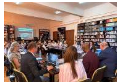
On 5 July, UNHCR took part in the 13 th Summer School on Refugee Protection and Rights, hosted by “Dunărea de Jos” University in Galați.