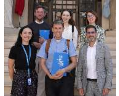
On 3 July, UNHCR met with the Anglican Communion’s Representative to the UN in Geneva.

UNHCR is grateful to the donors for unearmarked and softly earmarked contributions to the Ukraine situation. UNHCR in Romania is also grateful to donors contributing to 2025 programmes. For more details: Romania Funding Update – 2025