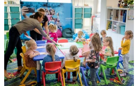
Refugee children from Ukraine attend a creative workshop at the UNHCR-supported KATYA Centre in Brașov.

UNHCR is grateful to the donors for unearmarked and softly earmarked contributions to the Ukraine situation. UNHCR in Romania is also grateful to donors contributing to 2025 programmes. For more details: Romania Funding Update – 2025