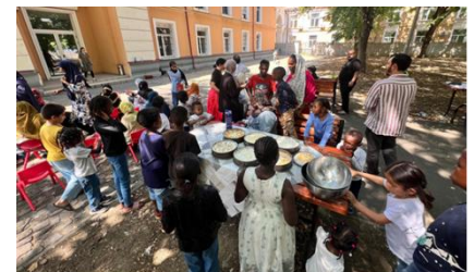
On 13 August, UNHCR and its partner AIDRom held a farewell event for refugees at the Emergency Transit Centre.