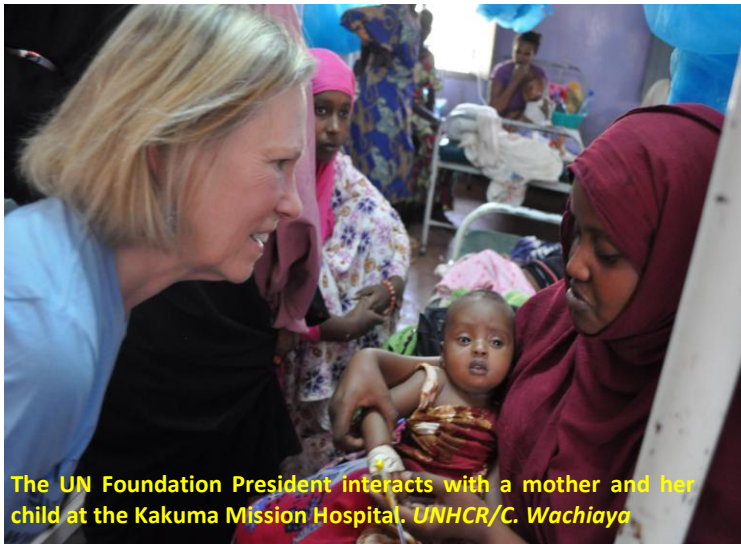
The UN Foundation President interacts with a mother and her child at the Kakuma Mission Hospital.

She was also briefed on UNHCR operations and the gaps we are facing. The Foundation has in the past donated 270,000 mosquito nets to the Kakuma operations. This being her first visit to a refugee camp and having witnessed the glaring gaps on the ground, the expectation is that much needed assistance will come out of this important mission.