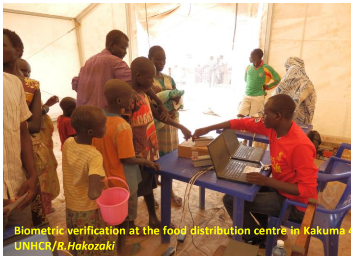
Biometric verification at the food distribution centre in Kakuma 4.

The biometric verification system is also ongoing smoothly to crosscheck details of individuals against the UNHCR database.