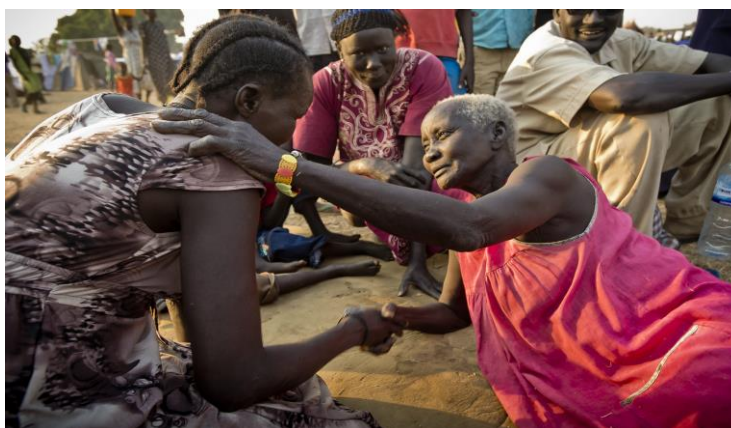
South Sudanese refugees at the Dzaipi Transit Centre in Uganda.