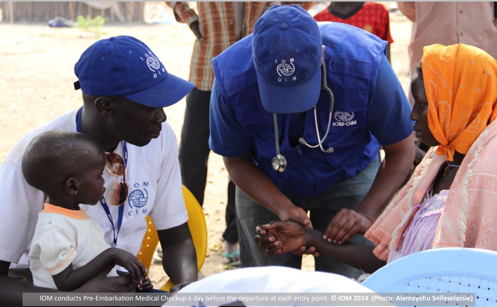
IOM conducts Pre-Embarkation Medical Checkup a day before the departure at each entry point.