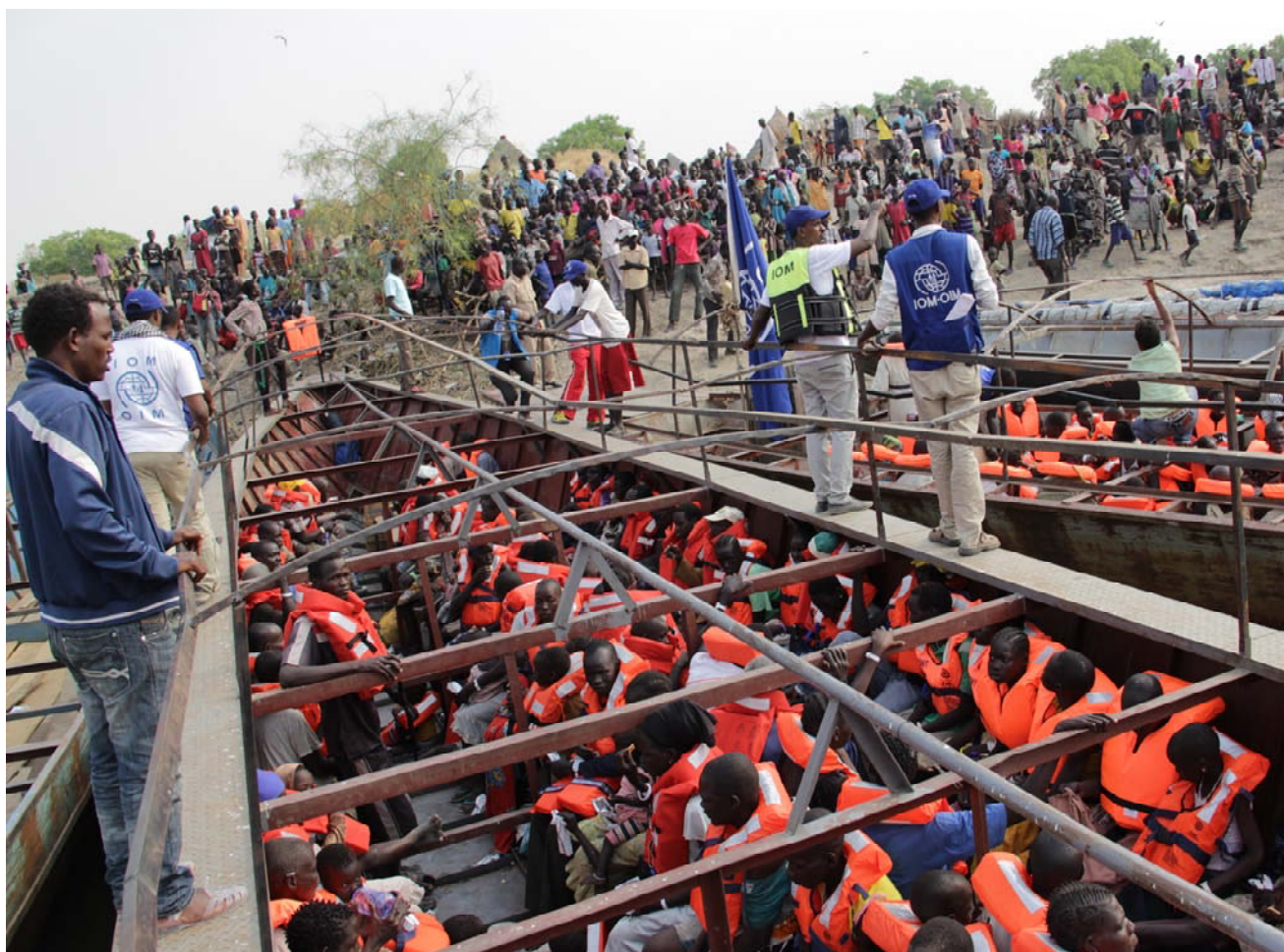
Refugees departing from Akobo -Tergol to - Burbey.