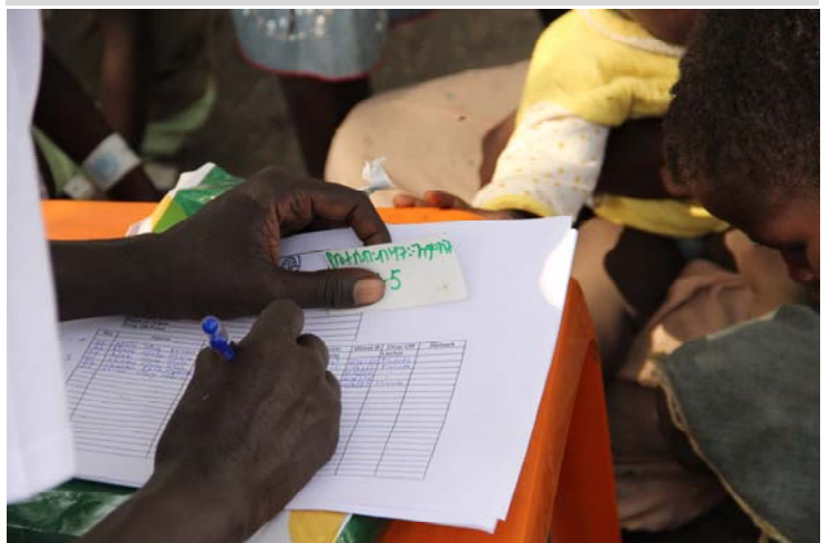
Refugees registered at Akobo a before departing on a boat trip to Burbey.