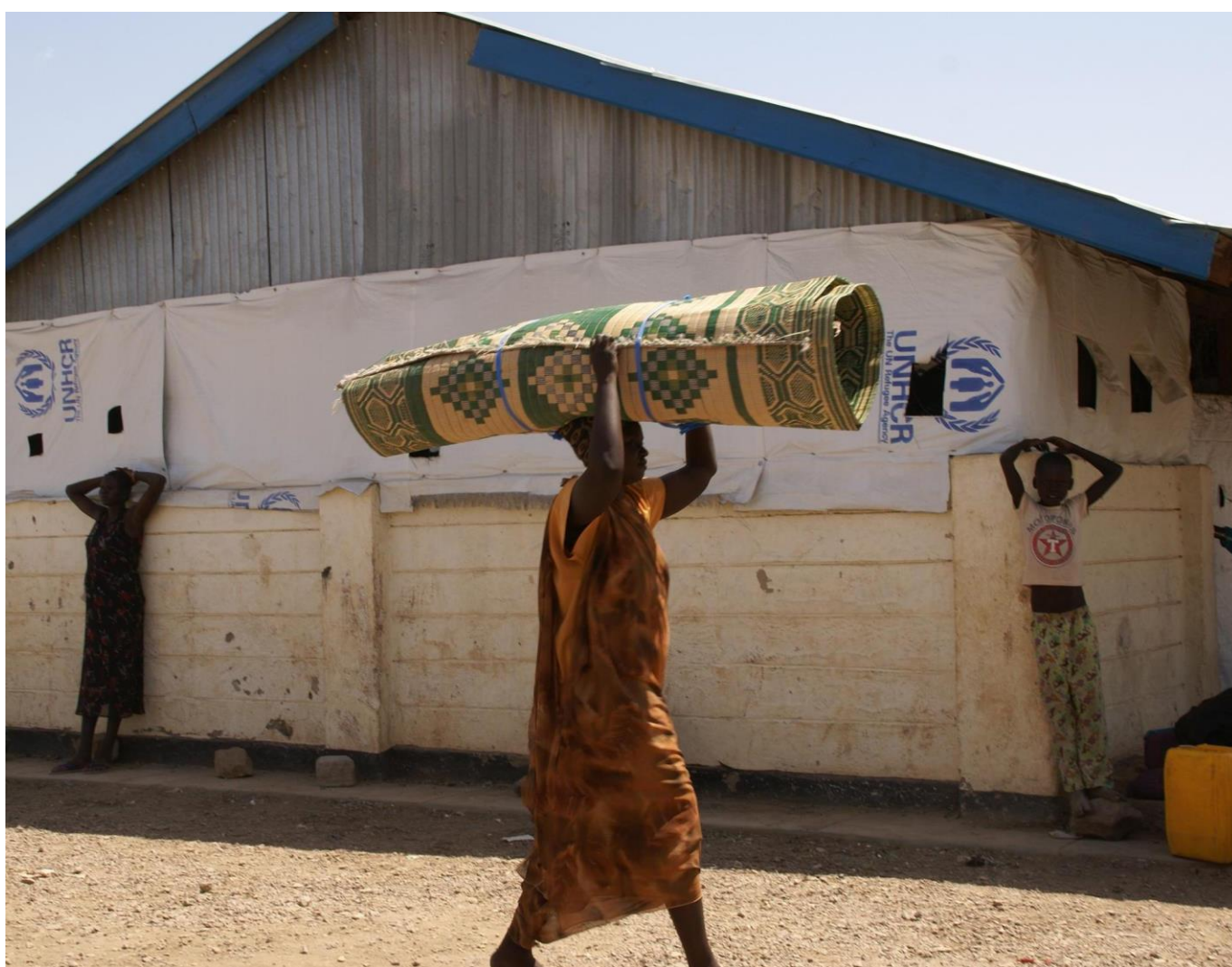
A South Sudanese woman carries a sleeping mat – Kakuma Refugee Camp (Kenya).

On 30 May, a 13-member delegation from the AU Commission of Inquiry visited Bentiu and met with among other UN agencies, UNHCR, National Police and some groups of IDPs including Sudanese nationals; the purpose was to gather information on some alleged atrocities that were committed during the conflict.