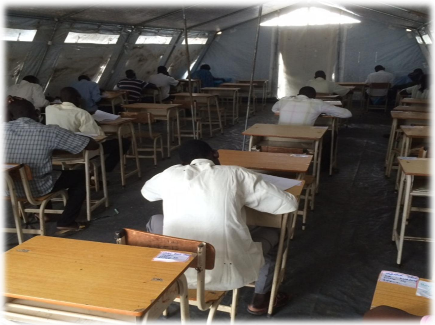
Students in Malakal protection of civilian's sites siting final grade examination

For further information or media enquiries,