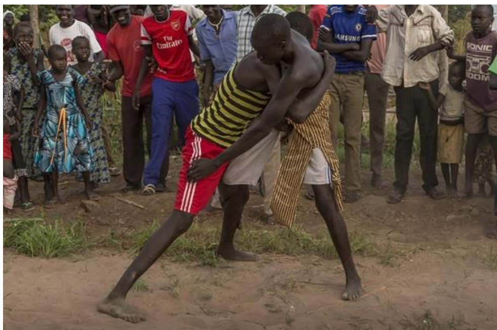
Two young Dinka men participate in a traditional Dinka wrestling tournament organised between Baratuku and Nyumanzi settlements in northern Uganda.

The Office of the Prime Minister (OPM) and UNHCR, with partner support, coordinate the maintenance of Nyumanzi transit centre (TC), Ocea reception centre (RC) Kiryandongo RC in the midwest which have accommodated the majority of newly arrived South Sudanese refugees. The registration of new arrivals in Kampala continues on a weekly basis.